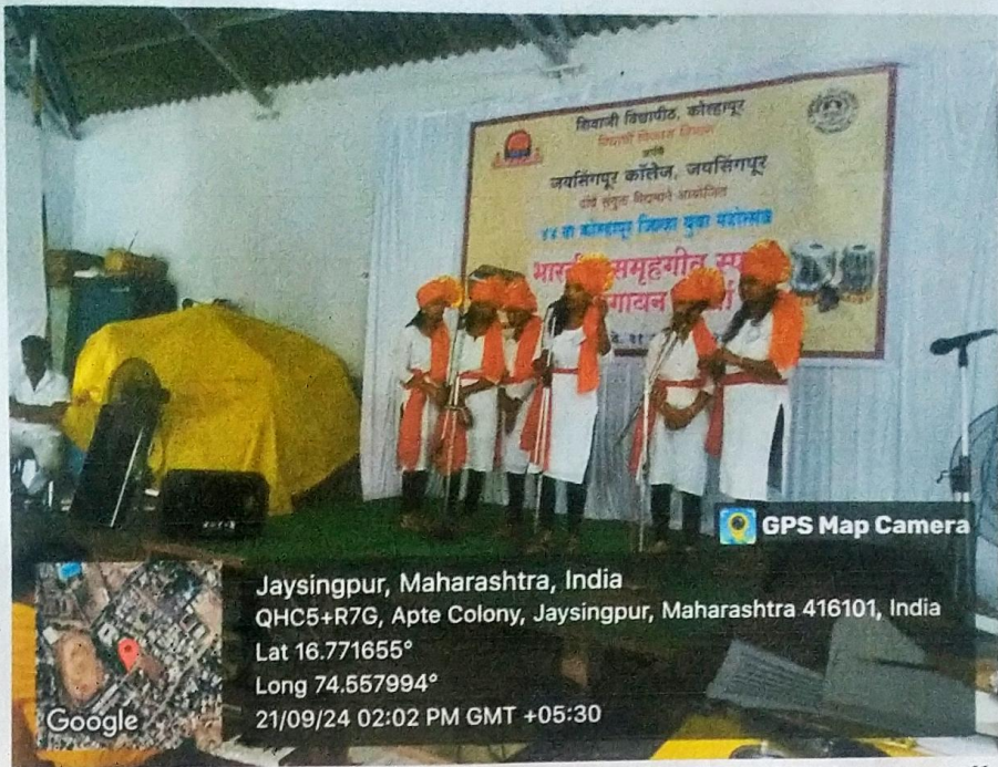
Caption: - Our students performing Indian Group Song at Jaysingpur college Jaysingpur.